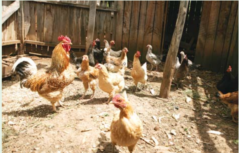
Indegineous chickens are easier to keep, less affected by diseases and tasty.

•Cost per kg would therefore be cost per chicken divided by weight of chicken which should be about 1.3kg. Thus Ksh\ 388 \div 1.3 = Ksh\ 298.5 .