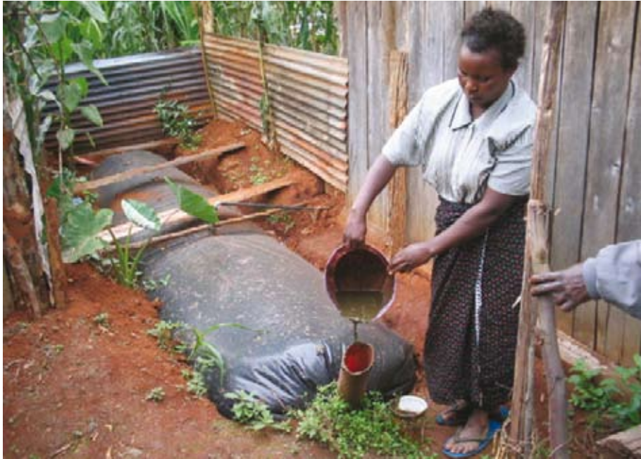
A farmer feeding a polythene digester with mixture of manure and water (slurry). Our photo does not show the roof that protects the digester from sunlight.