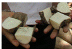
Cut seed setts immersed in chemical dip.