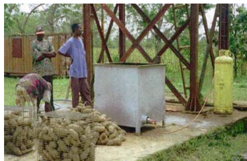
Gas fuelled hot water tank with yam ready for dipping. – P. Spiejer

Exposure to a temperature of 50-55°C for 20-25 minutes disinfects tubers of most pests and pathogens. A large container that can be heated, into which yam tubers are submerged, preferably with a thermostat that will help maintain the water at a constant temperature, is required. The container can be constructed locally.