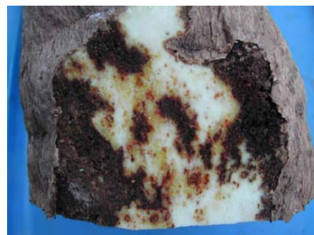
Sub-surface necrosis caused by lesion nematodes. – D. Coyne

Numerous pests and diseases affect yam tubers. Nematodes, a particular concern, manifest during storage and facilitate tuber rot by fungi and bacteria. Viruses, on the other hand, can be devastating in the field during the growing period. Most bio-constraints affect seed productivity and viability, reducing germination, plant vigor and yield. The use of good quality and healthy seed material is therefore a crucial foundation for high and sustainable yam production, as it is for other clonally propagated crops, such as potato. The use of diseased seed tubers results in the production of small, poor quality ware yam and a persistent cyclical decline. To prevent the introduction of pests and diseases into the production cycle, it is essential that healthy planting material is supplied to producers. However, obtaining healthy seed yam is one of the biggest problems for growers. Some farmers use their own seed stock, harvested from the previous season, while others obtain the seed material from specialized seed yam producers.