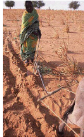
Figure 1: The plough in use in Darfur