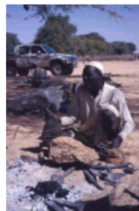
Figure 3: Metalworking in Darfur.

When the rains come, the water cannot penetrate the soil. The project officer, at the time, introduced an implement used