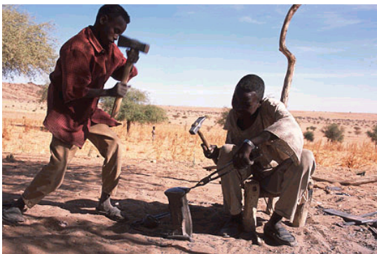
Figure 4: hammering one of the component parts of the plough.

After initial trials in the project area (Kebkabiya), this technology was scaled up and disseminated to other areas in North Darfur including Azagarfa Village,