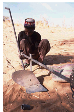
Figure 6: Assembly of the plough.

The donkey plough demonstrates the relationship between the different aspects of Practical Action's work from the adaptation of a traditional technology to the development of an intermediate technology and brings together farming, metalworking and the production of improved harnesses.