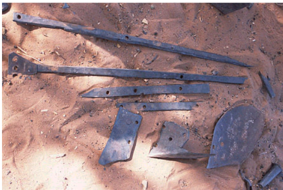
Figure 5: The plough before assembly

The conditions in which the ploughs are manufactured are fairly basic and the tools available to the blacksmiths are limited.